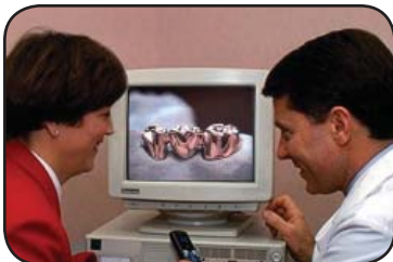
Hygienist offering suggestions

Prior to graduation, a hygienist must pass rigorous tests and complete hundreds of clock hours of supervised instruction in clinical practice.