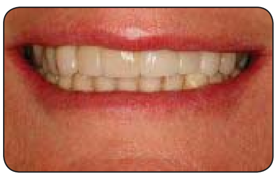
The result is a dazzling smile